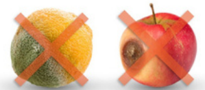
Faster decaying and significant losses within uncontrolled conditions

The Bio Turbo not only deals with both ethylene and bacteria challenges in the most advanced method, but it does this in the most economical way. The low operating costs makes Bio Turbo the most profitable choice. Ozone never leaves the Bio Turbo , as the process takes place inside the unit and not in your facility.