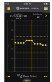
Optional Kestrel LiNK