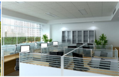
HEATING & LIGHTING