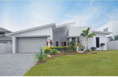
SECURITY & ALARMS