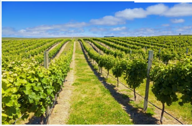
GENERATORS & PUMPS